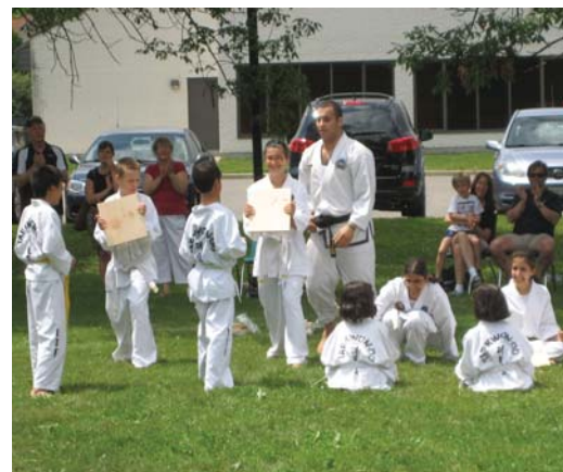
Johnsons Taekwon-do students